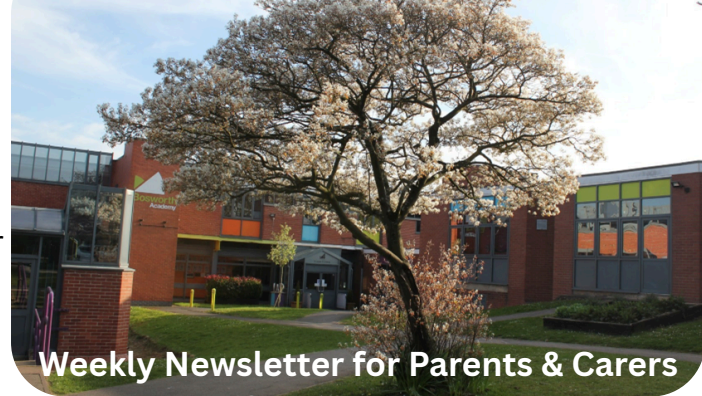
Weekly Newsletter for Parents & Carers